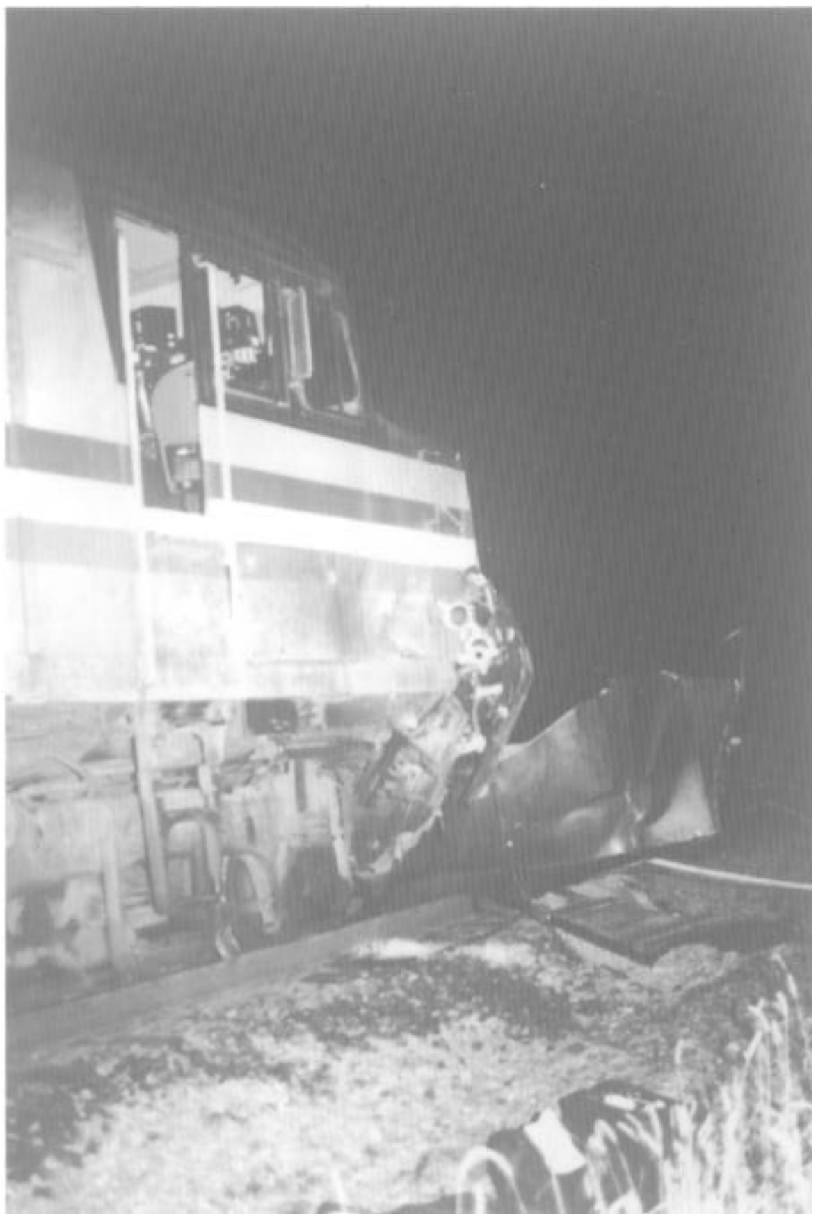
Right front of locomotive 319