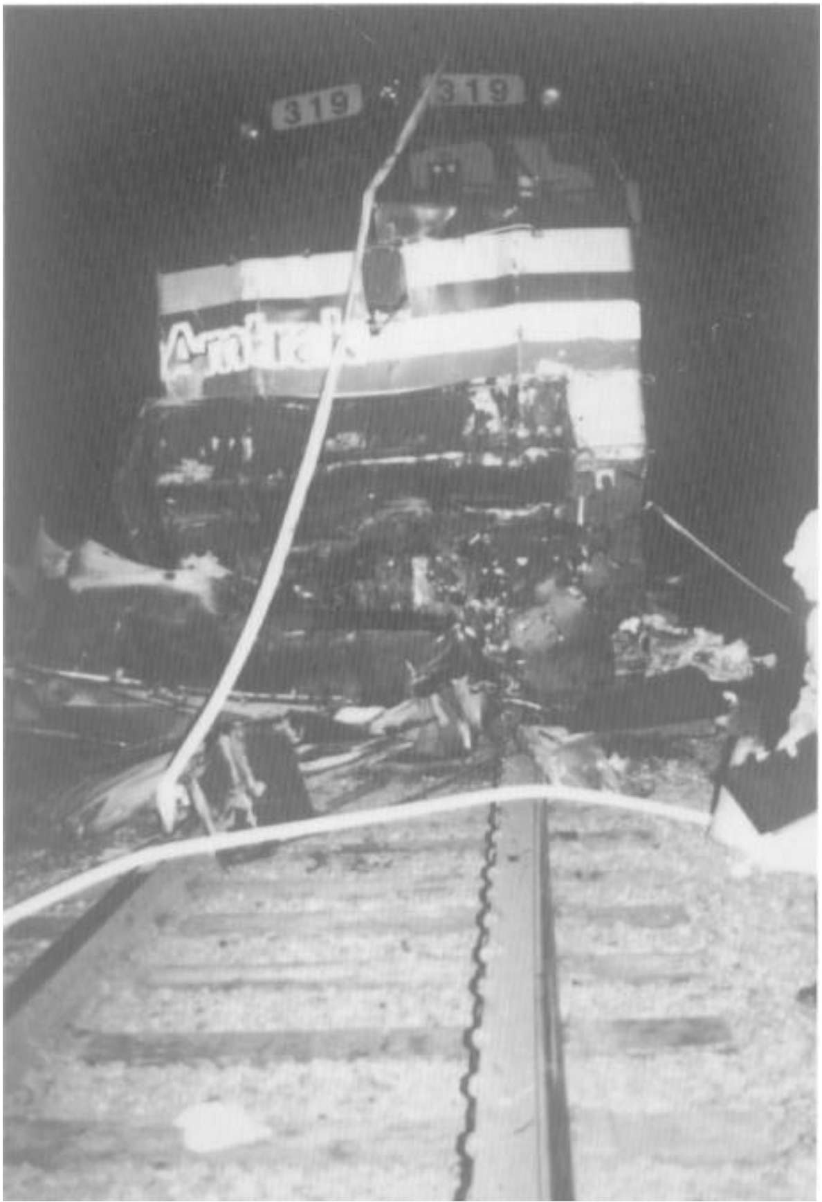
Front of locomotive 319