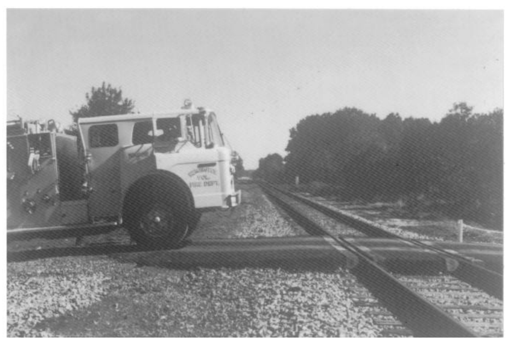
Wagon 2 at accident crossing - camera facing north