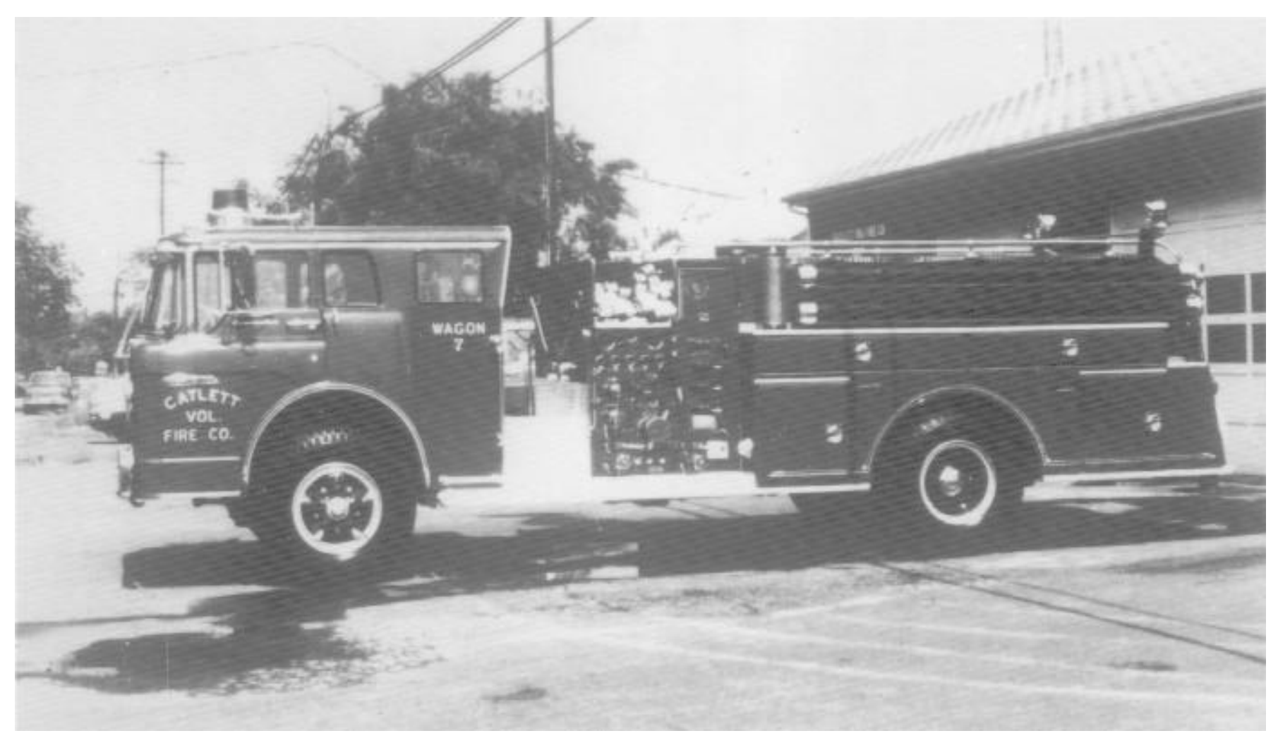
Left side of Wagon 7